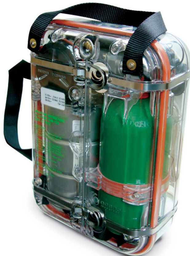
The EBA 6.5, in its clear, polycarbonate case, is durable and easy to inspect.

Easy to inspect – simple visual inspection confirms that unit is ready to use.