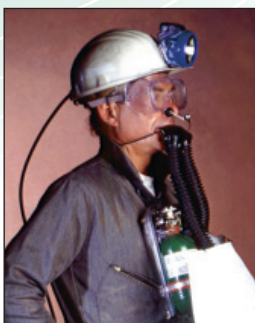
The EBA 6.5 can be donned in 15 seconds or less.

Since introducing the EBA 6.5, Ocenco Inc. has sold more emergency escape breathing apparatus to the worlds mining industry than all other manufacturers combined.