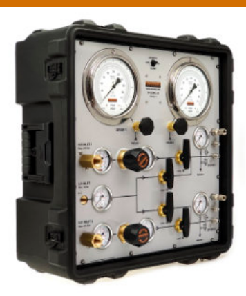
DIVING AIR Cases & Panels