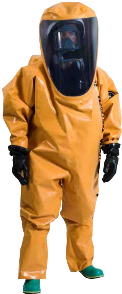
Type VP1 with sewn-in socks/booties and separate boots.

Provides maximum protection against hazardous chemicals in liquid, vapor, gaseous and solid form, including warfare agents. Trellchem® VPS-Flash is fully certified in accordance with the American standard NFPA 1991, including the optional chemical flash fire and liquefied gas protection requirements. The suit is also certified to the European standard EN 943-1 and EN 943-2.