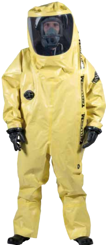
Trelchem ® VPS type CV with sewn-in socks/booties and separate boots.

Provides maximum protection against hazardous chemicals in liquid, vapor, gaseous and solid form, including warfare agents. Trelchem ® VPS is certified to the European standards EN 943-1 and EN 943-2/ET.